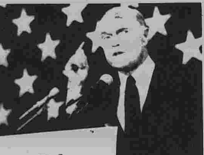
John Glenn stumped in Des Moines Sunday seeking votes in tonight's first-in-the-nation Democratic caucuses.

DES MOINES, Iowa — An estimated 85,000 to 90,000 Iowa Democrats planning to attend one of the 4,855 precinct caucuses and schools tonight for the first caucuses of 1984, beginning the final showdown for the eight Democrats seeking to oppose President Reagan.